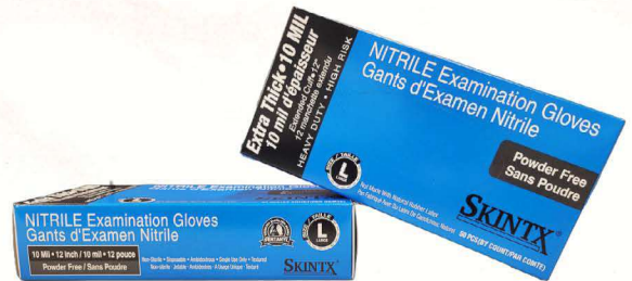
SKINTX 10Mil 12\"/>