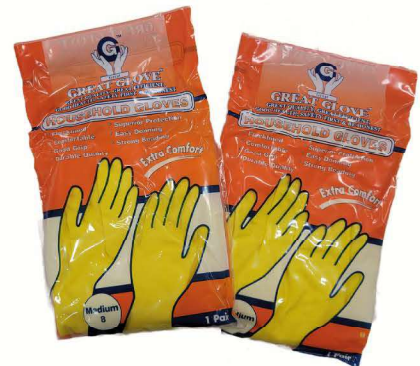
GREAT GLOVE Yellow Household Gloves Packing: 12pairs per bag / 12 bags per case Description: Flocklined

Size / Product Code Small / SP200-S Medium / SP200-M Large / SP200-L X-Large / SP200-XL