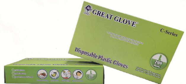
Great Glove Cast Poly Gloves (CPE) Packing: 200pcs per box / 10box per case Description: Embossed interior

Size / Product Code Small / HP500-S Medium / HP500-M Large / HP500-L X-Large / HP500-XL