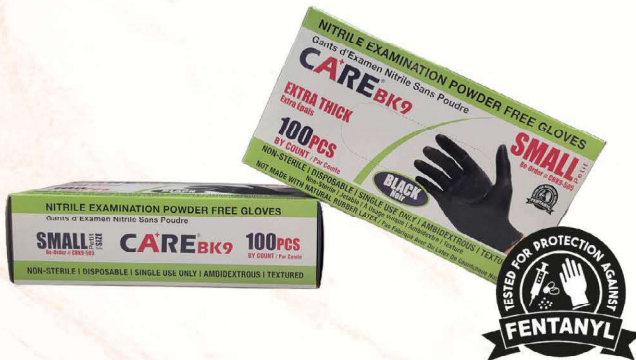
CARE Black Nitrile Exam Powder Free Gloves Packing: 100pcs per box / 10box per case (XL = 90 pcs) Description: Textured, 6mil