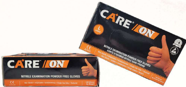
CARE Orange Nitrile Exam Powder Free Gloves Packing: 100pcs per box / 10box per case Description: Textured, 5.5mil