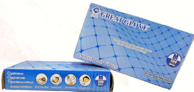
GREAT GLOVE Stretch Poly Gloves (TPE) Packing: 200pcs per box / 10box per case Description: Embossed interior

Size / Product Code Small / CP200-S Medium / CP200-M Large / CP200-L X-Large / CP200-XL