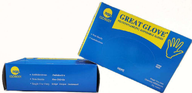
Great Glove High Density Poly Gloves Packing: 500pcs per box / 20box per case Description: Contains no latex content

Size / Product Code Small / HP500-S Medium / HP500-M Large / HP500-L X-Large / HP500-XL